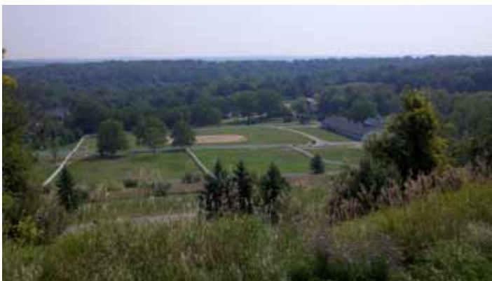
The view from Mount Christie, near Flint, Michigan