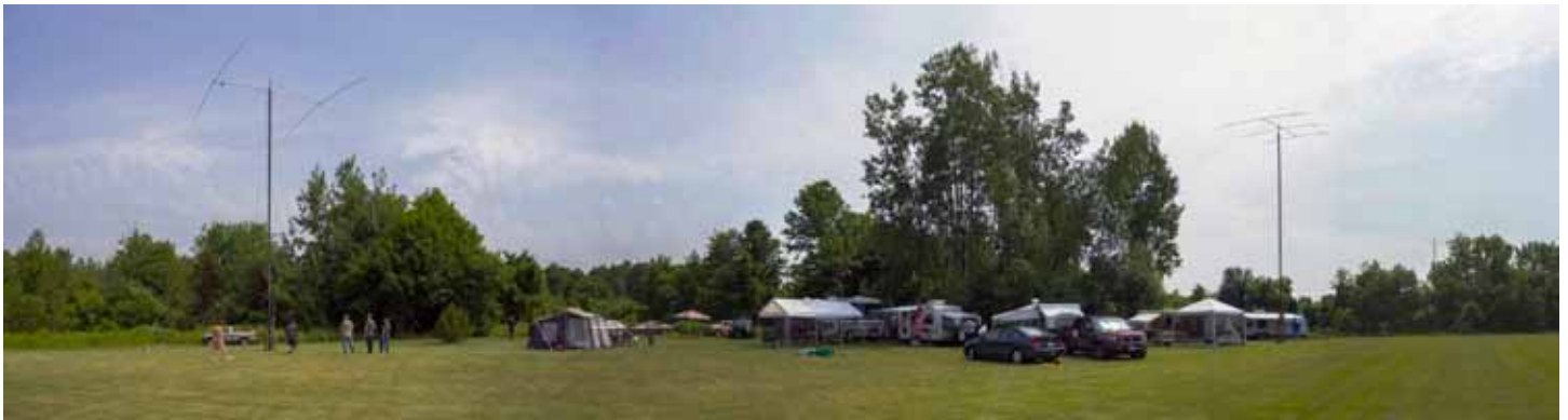
HCRA Field Day panorama, June 2013, at Agawam's School Street Park.