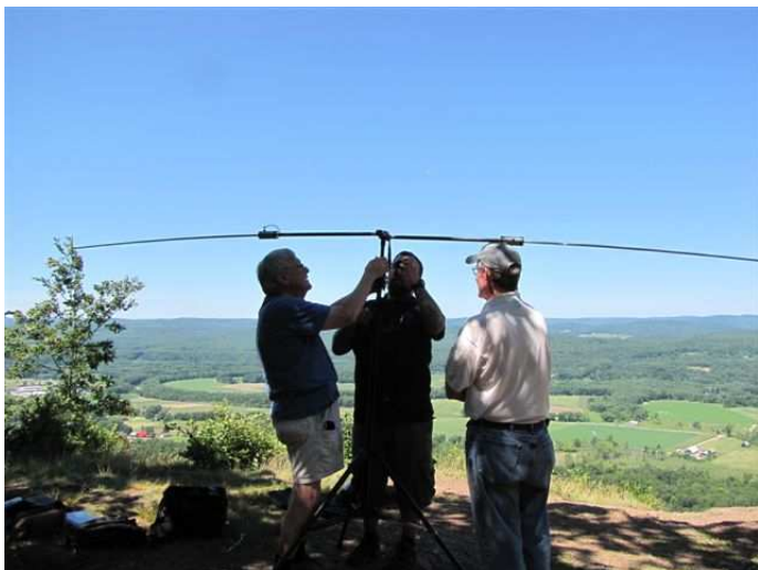
Setting up & guying the Buddipole