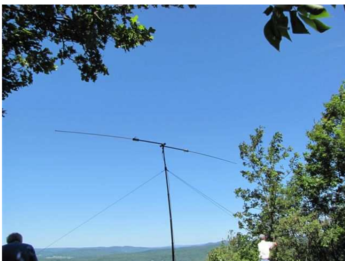
The Buddipole is up and working great!