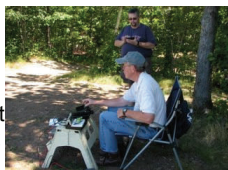
KK1W on Pocumtuck Rock

There's a new activity in town and it's called "Summits On The Air" (SOTA). SOTA is very similar to Islands On The Air (IOTA) except you activate mountain tops instead of islands. It is very popular in Europe and is starting to catch hold here in the colonies. It's fun, easy and best of all will get you out of your chair and into the fresh air for some exercise, fun and ham radio – what's wrong with that? Read more about it at: http://www.sota.org.uk/ .