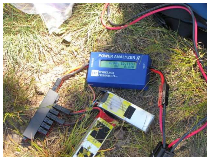
Powerpoles are universal + watching the voltage