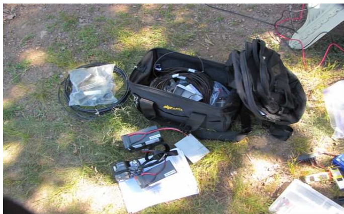
A good GO KIT is essential