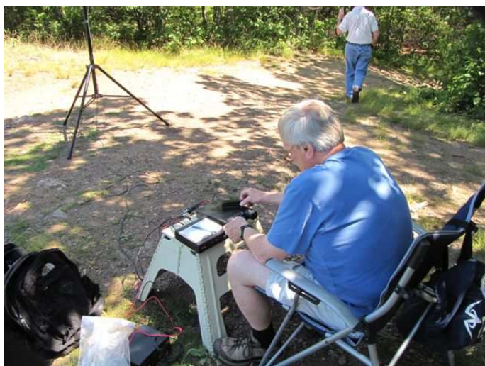
N1FJ + FT-857 + Palm Paddle + Battery = contacts