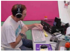
K1MZ operating at Field Day