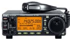
Win an Icom IC-703 at the November Auction. Tickets on sale now!