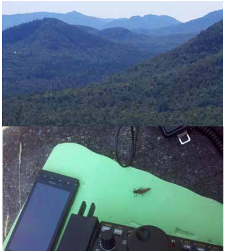
A view in the Adirondacks and a paddle AND a bug?

4th Monday of February, May, August, November 7:00 PM, FCARC VE Exams, Unitarian Church, Main Street, Northfield