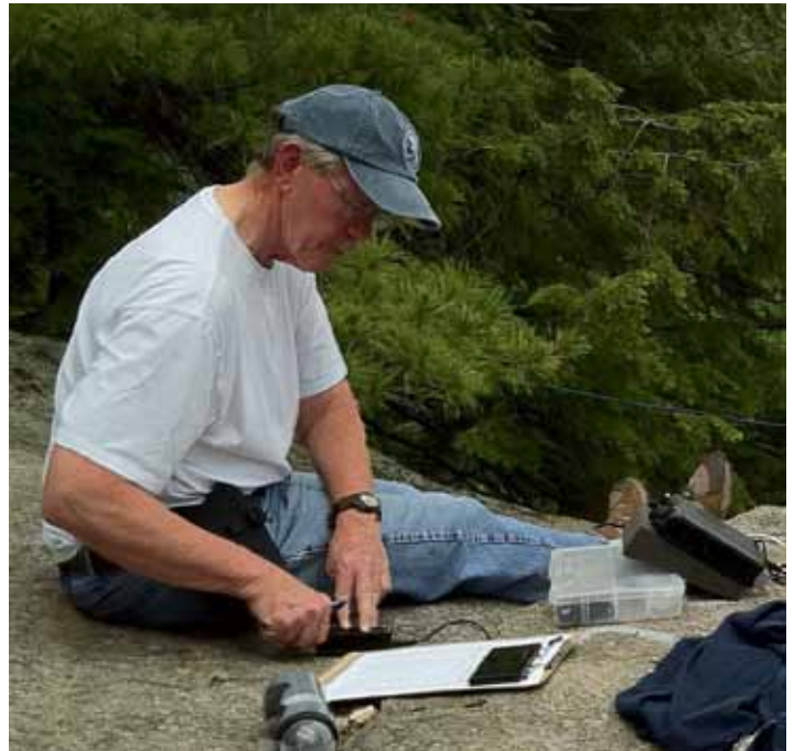
At my "summer shack!"

ARRL 10-Meter contest is this December. This year should be an exciting one, especially based on recent 10-meter band openings. Look for more information from