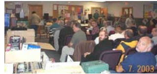
A view of the crowd from last year.

In just a few days HCRA auction 2004 will be history. Will you be one of the lucky hams to go home with a genuine bargain? Will your XYL be even luckier if you sell all that 'stuff' that's gathered in the basement over the years? Will YOU win the Icom IC-703? I don't know the answer to these questions but I do know if you go to the auction this Friday it could be you! And I'm certain you will have LOTS of fun—even if you don't win the Icom.