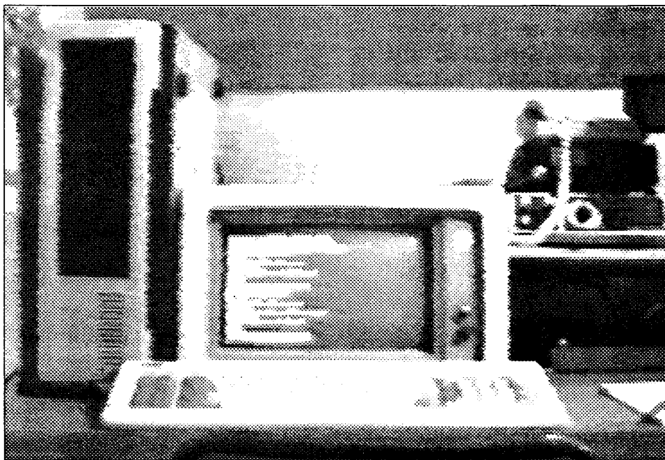
The W1NY-2 bulletin board system consists of a "PC clone", a Lafayette HA-146 for 2 meters, and a Kenwood TM-3530 for 220. The TNC is a DRSI PC*PA card, which goes inside the computer.