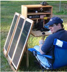
FD 2004 - 1st in WMA!

Well, a new year has arrived and as is usual for editorials in this season I guess we should take a brief look back at HCRA and our accomplishments of 2004. It was a year of both exciting and sad events.