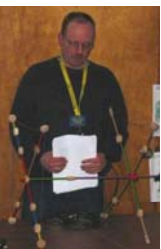
Show & Tell