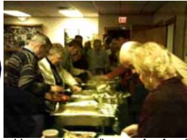
Hungry hams line up for food at this year's party