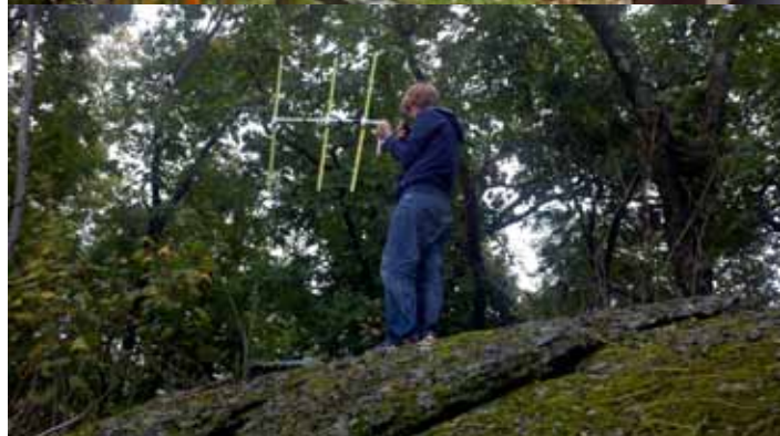
From top: KX3, KK1W, K1MAZ