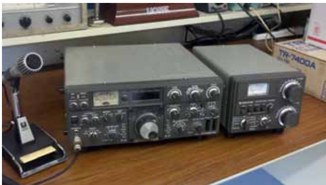
Kenwood MC-50 mic, TS-830S, AT-230