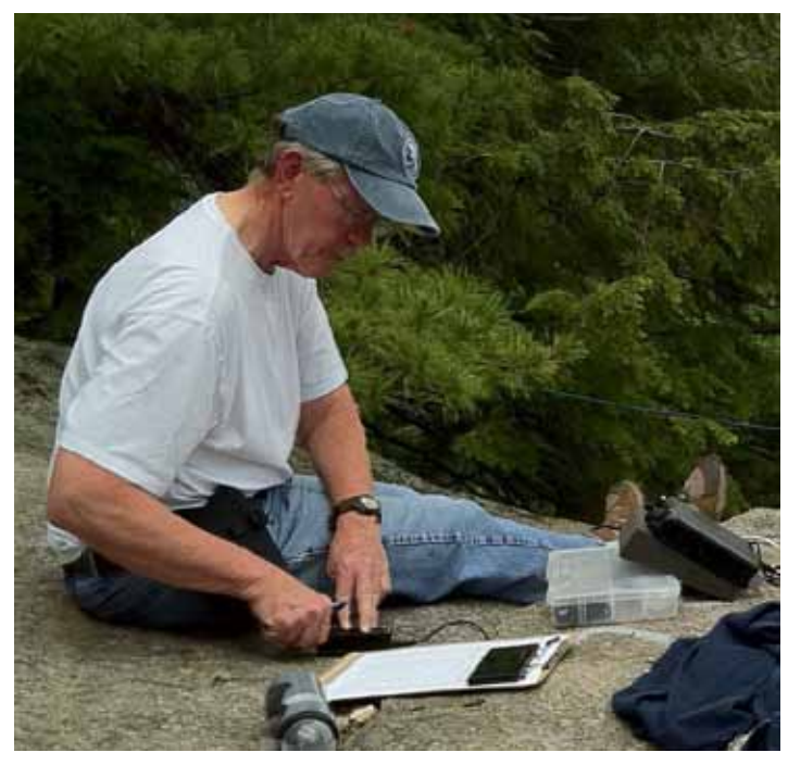
At my "summer shack!"

ARRL 10-Meter contest is this December. This year should be an exciting one, especially based on recent 10-meter band openings. Look for more information from