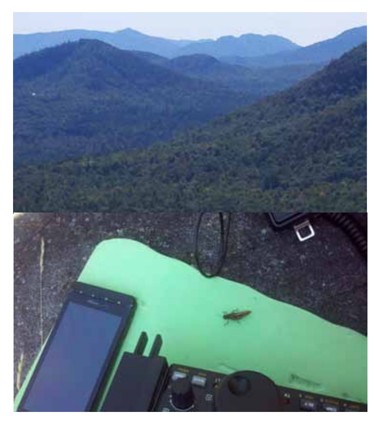
A view in the Adirondacks and a paddle AND a bug?

4th Monday of February, May, August, November 7:00 PM, FCARC VE Exams, Unitarian Church, Main Street, Northfield