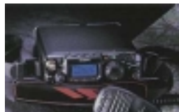
Yaesu FT-817 Auction Grand Prize Raffle

The drawing will be held at the auction during the break, typically around 9:00 PM. Tickets are still available and will be sold during the auction. For as little as $1 ($5 for a book of six) you could go home with a brand new Yaesu FT-817, one of the hottest selling rigs on the planet! Yet another reason to attend this month's meeting. Just think, you could come home with a new rig and not have to explain the credit card bill to your spouse next month. Second prize is a Radio Amateur Callbook CD and third prize is a Bencher DC power distribution panel. Winners need not be present.