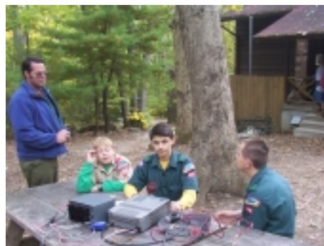
AA1YW, with a new possible Crew member. Also, KB1FWN and KBiHUM at JOTA, QRV in RI.

That night, Kx1x cooked us most of (or an entire) cow over a fire. We feasted with 424 over it, and even liked it (as if we had a choice)! Then we retreated back to the cabin to play some more radio. The leisurely DX was rolling in from Jeff, who refused to leave the radio alone. When the night activities started and it was time for John's evening class, no one showed up. Oh well, can't win them all. The first class was packed, and most of them seemed to be paying attention, although we caught one sleeping. Radio merit badge is a rare patch, and some people are actually after it!