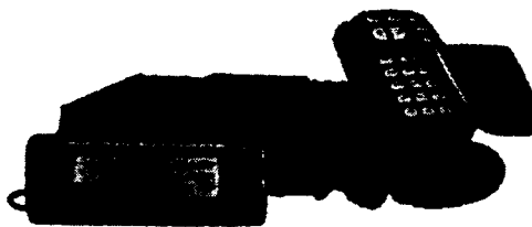
IC-207H Dual Band Mobile