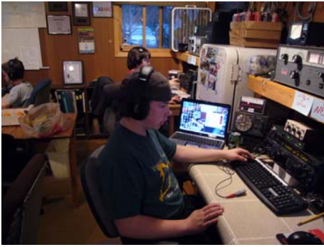
CQ WW WPX at K1TTT's in Peru, MA with Venture Crew 510 (DX). March 23-25, 2007