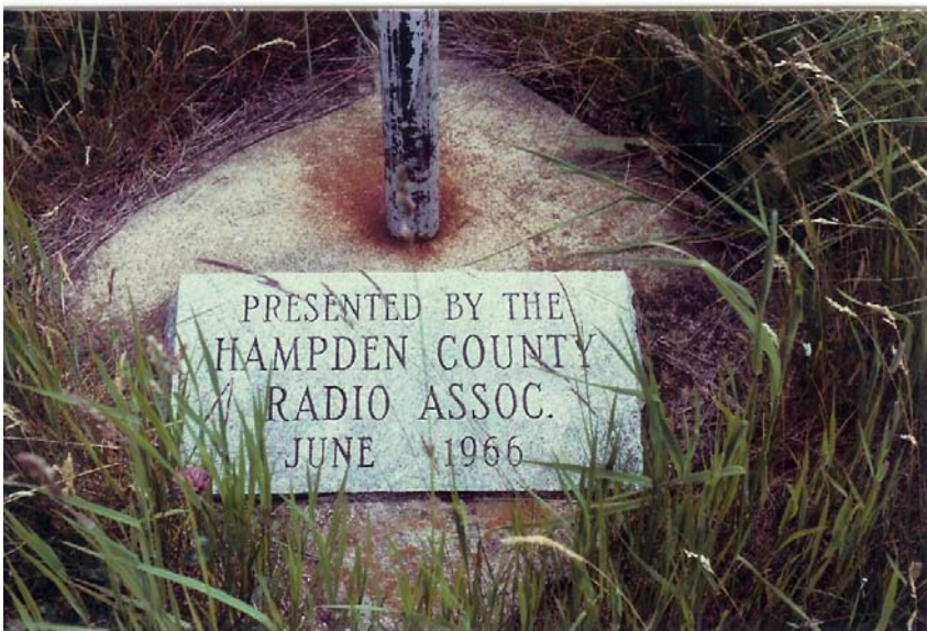
Plaque At Base Of Flagpole