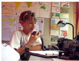
Young OP at K2BSA