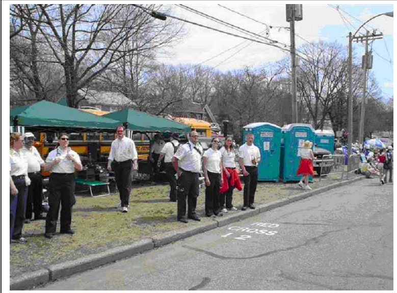
First Aid Station 12 during quiet time.

Western Massachusetts Hams joined 150 other operators from three states to link the entire course. The unusual heat during the race meant heavy communications activity. Throughout the course runners required medical assistance, medical bus transportation & ambulance assistance. All these requests went through the amateur radio 2-meter nets.