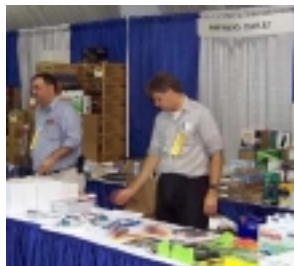
HRO Personnel at the New England Convention