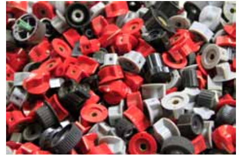
I don't know if anyone bought any knobs, but they made a nice abstract art display!