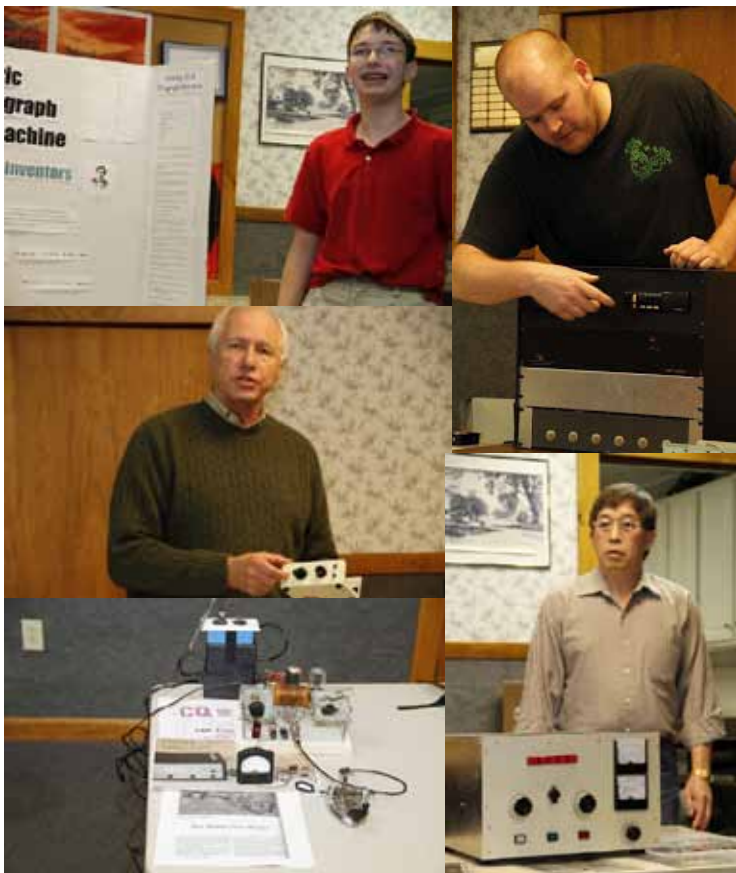
A few examples from a previous Show and Tell

If you haven't had your fair share of ham radio after the HCRA Show & Tell meeting and the MTARA Hamfest, make sure to check out the ARRL International DX Phone contest. This contest is one of the "Big Four" and is a great opportunity to get your feet wet in contesting, hone your skills, or add a few new entities to your log. In this contest, stations outside the US are looking for US stations to work so you ARE the "DX". US stations give signal report and state, non-US stations give signal report and power level. Conditions for the CW version two weeks earlier were excellent and because all the bands were open, there was plenty of space to find a spot to call CQ. So fire up your radio, put some time in the chair and enjoy working the world. For more information see http://www.arrl.org/arrl-dx .