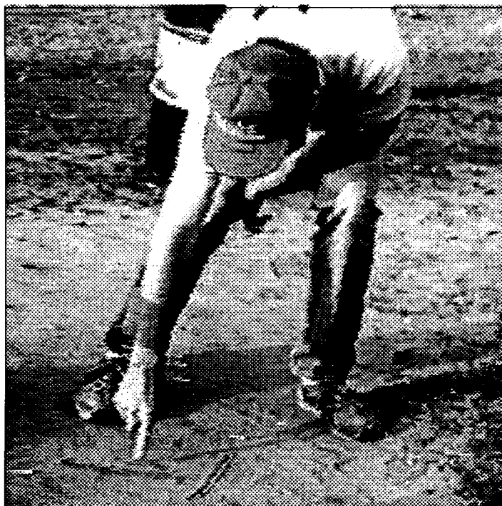
Bob, KA1KPH , uses the manual method of tracking a threatening storm at the W1NY Field Day site.

With TCP/IP, you can transfer ascii or binary files, chat with other stations and move mail through the IP network. As an added bonus, the software also allows conventional AX.25 capabilities,