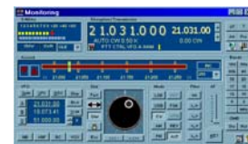
Screenshot of TRX-Manager

Have you wanted combine the fun of radio with the convenience of a personal computer? Wouldn't it be nice to have memory banks of your favorite HF frequencies available with just a mouse click? How about DXCC, logging and printing QSL's or scoring contests? A PC connected to your radio can do that and more, sometimes with just a click of the mouse.