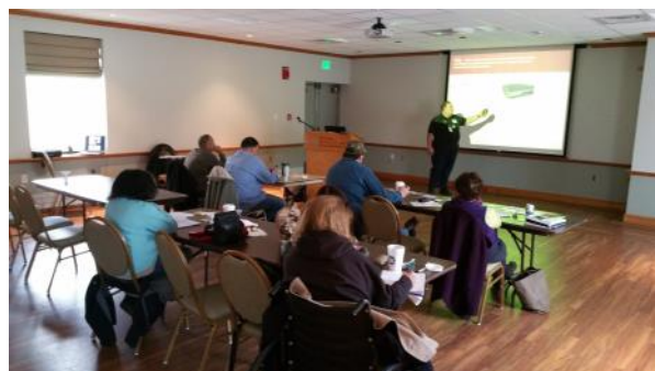
Rich N1KXR teaching.