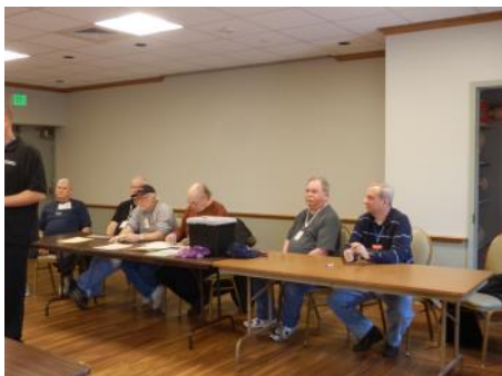
VE's waiting for their students to finish.