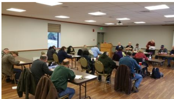
Taking the test.