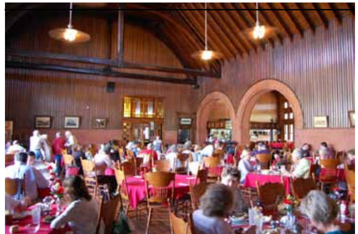
Interior of Steaming Tender