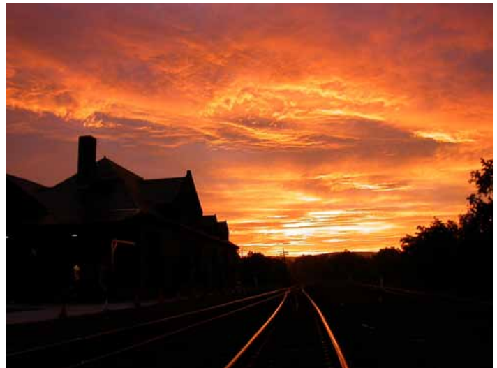
View of Steaming Tender at night

The second annual H.C.R.A./M.T.A.R.A. Holiday Party extravaganza will be held Monday, December 9, 2013, at the Steaming Tender Restaurant in Palmer, Massachusetts. A fine evening of New England holiday fare and potables will be served as you take the opportunity to dine and socialize with your many friends and fellow club members amidst the ambiance of a quaint restored train station, now the home of a celebrated New England restaurant festooned in holiday decor. The evening begins at 6:00