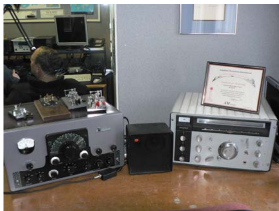
Another sta- tion on display on the right.

Hampden County Radio Association P.O. Box 562 Agawam, Massachusetts 01001