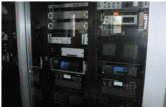
W1AW station radios on the left.