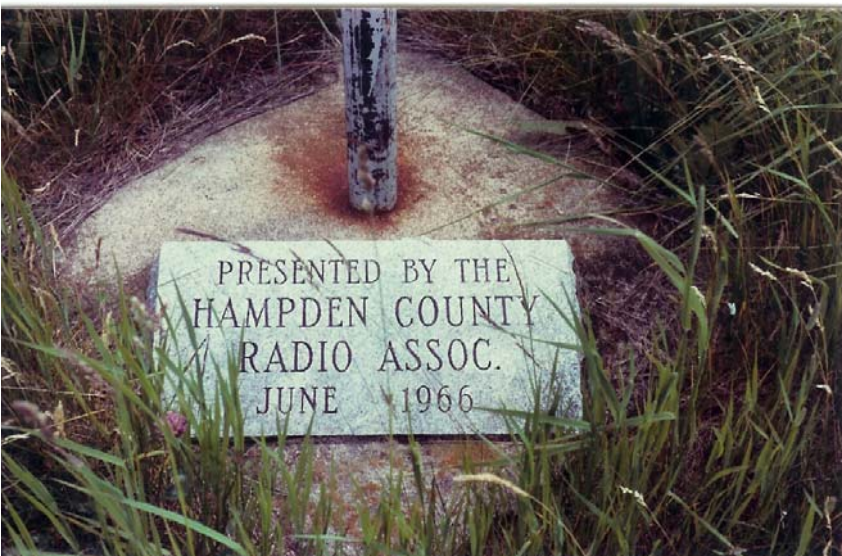
Plaque At Base Of Flagpole