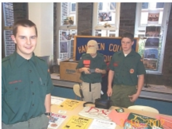
On the left , KB1HUM, KB1GHC, and KB1FTX work the table at the MTARA flea market.