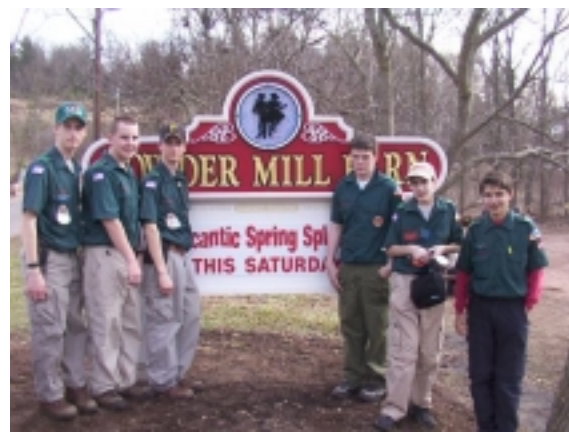
On the right , crew members pose for a picture after a public service event at the Scantic Spring Splash canoe race.