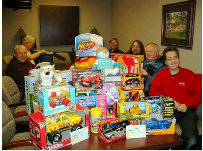
A picture of Christmas joy for the children of the Gulf

Here's a picture of your generous donations just before being packed and shipped to the Salvation Army. In the background are your board members - but why are they smiling? Because they (would you believe it?) were playing with the toys. Grown men, I guess we know why ham radio is so attractive now, don't we?