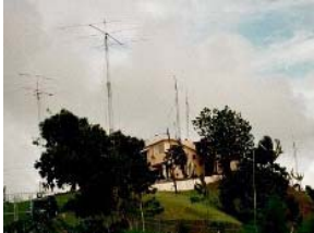
Contesting as it should be!

This month brings another unique meeting to our club. It's always interesting when members of another club stop by and relate how they get fun out of our wonderful hobby. This meeting will be no exception when the CTRI contest group visits HCRA.